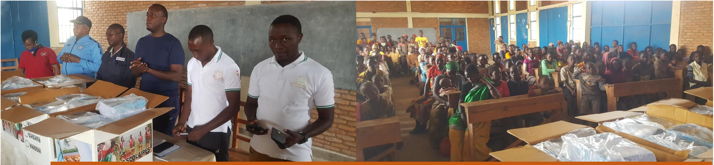
REVEIL COMMUNAUTAIRE D'ASSISTANCE AUX VICTIMES

As we always do, by supporting children, a word of peace and sensitization against the proliferation of small arms and light weapons. Then, the general specified diverse consequences of arms misusage and urge the administration to help in sensitizing for the common interest of the community.